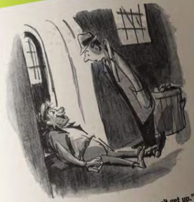
"I'm not powerless over alcohol. I just can't get up." — A Rabbit Walks Into a Bar