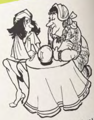
"Who cares about the future — where the hell was I last night?" — A Rabbit Walks Into a Bar